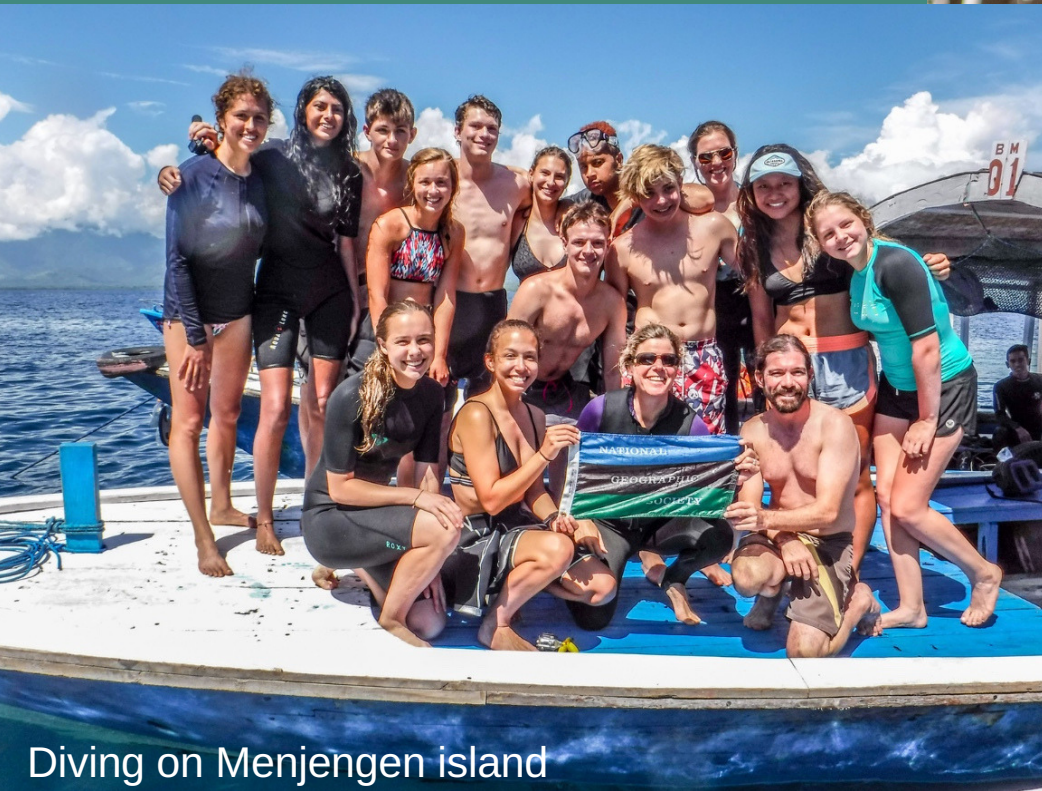
Diving on Menjengen island