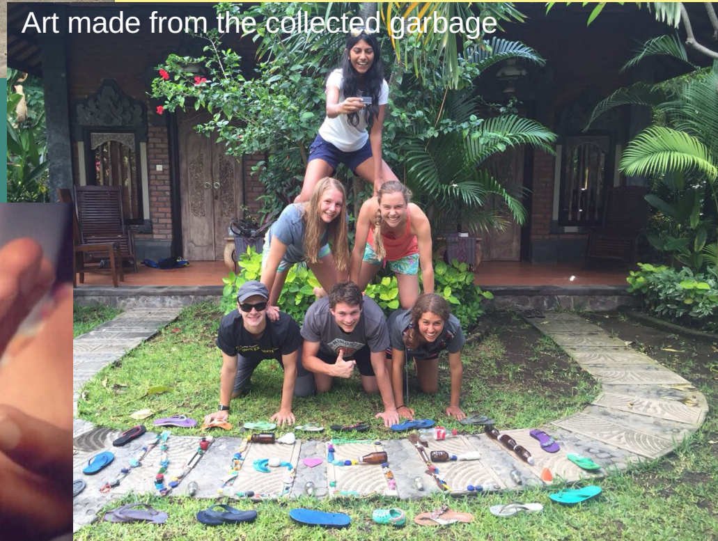
Art made from the collected garbage