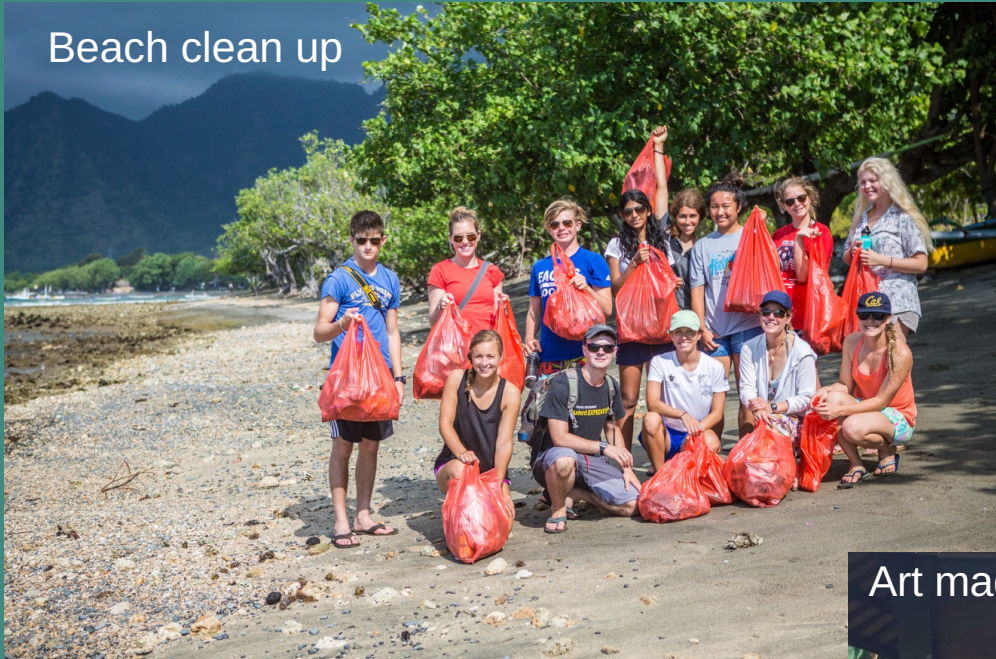
Beach clean up