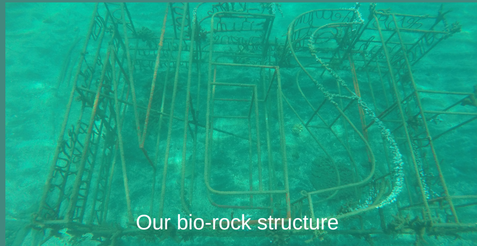
Our bio-rock structure

Created fish nurseries (bio-rock structures), conducted reef-checks, met field expert, Tierney Thys, scuba-dived, organised beach clean-ups, visited the turtle nursery, and received metal straws.