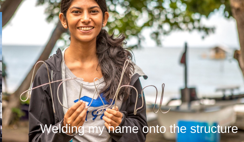
Welding my name onto the structure