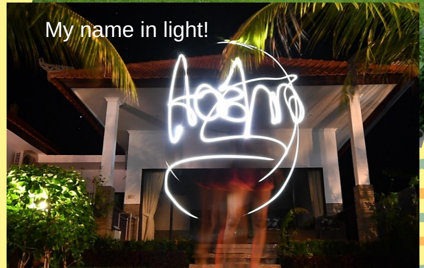
My name in light!

Orientation, learnt Balinese practice of free diving, learnt light photography, and snorkelled